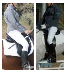
Classic dress : 8 points