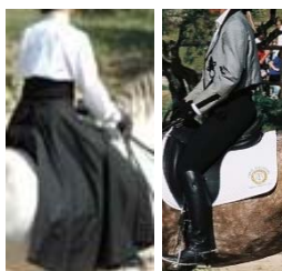
12 points PART DRESS