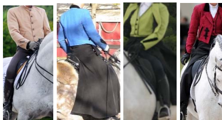
14 points with classical boots and trousers