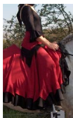
10 points FOLK DRESS